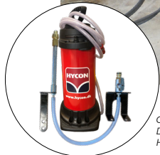
Optional: Dust suppression kit, Item no. 1113286 HYCON Water Container, Item no. 3030051

Contact us for more information: hycon@hycon.dk / +45 96 47 52 00