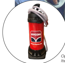
Optional Dust suppression kit Item no. 3030051

Contact us for more information: hycon@hycon.dk / +45 96 47 52 00